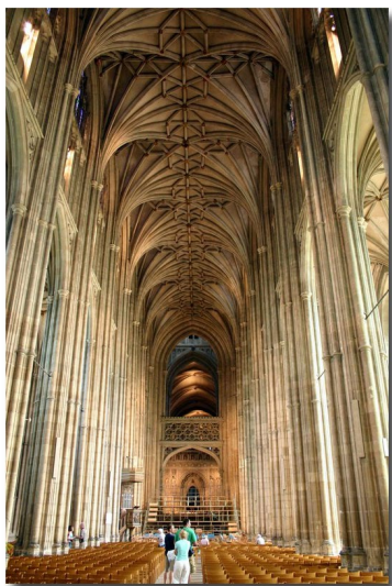
The nave of Canterbury Cathedral, and the Houses of Parliament and Big Ben, at right. Below, the exterior of St. Paul's Cathedral.