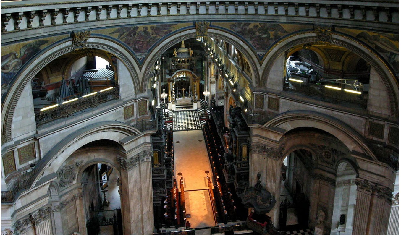
The interior of St. Paul's Cathedral in London.